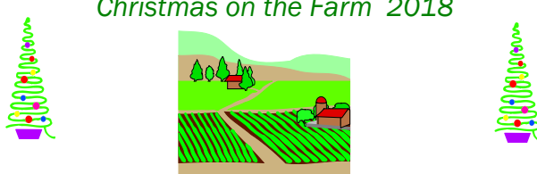
Christmas on the Farm 2018

Friends of the Lena Armstrong Public Library