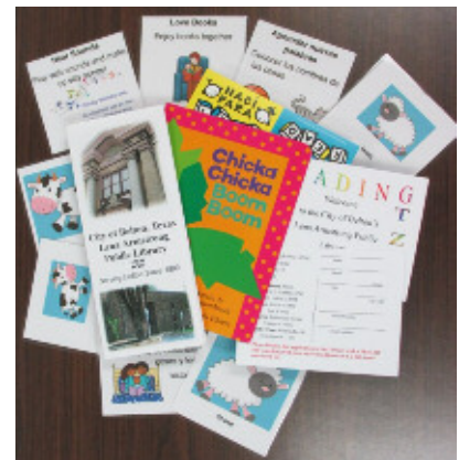
Bundle of Joy