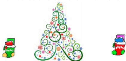
Christmas on the Chisholm Trail 2018

Friends of the Lena Armstrong Public Library